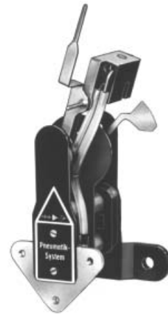
PP converter (low-pressure switch)

Outlet connection (3) with low-pressure switch (PP-converter) mounted on the back side of the pressure gauge, hose connection 2 x 1 mm (.08 x .04"); separate converters for each limit-switch required; separate connection 1/8" BSP female for air supply